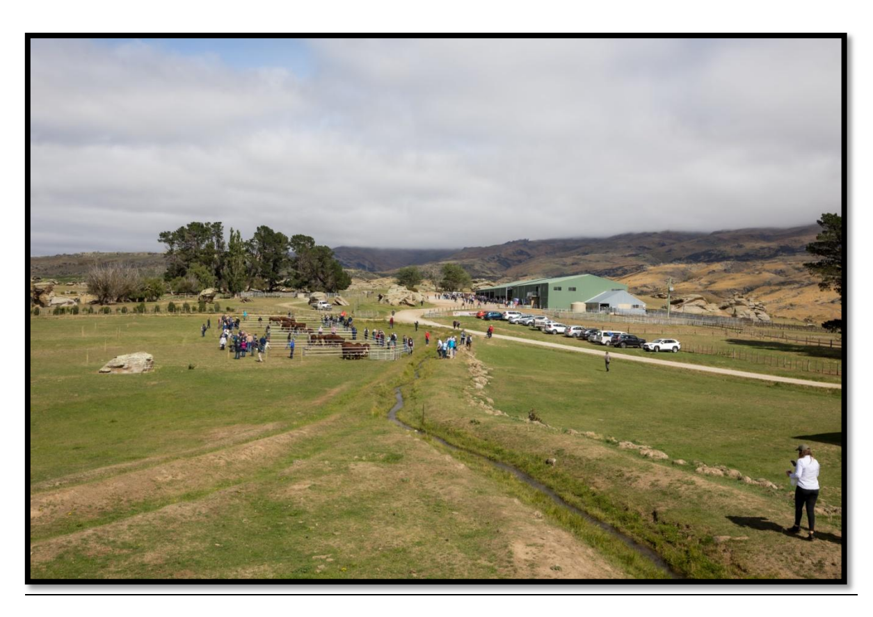
Field Day at Earsncleugh Station

Like everyone else shortly after the WHC we went into lockdown which was just prior to our National Sale. For the first time in many years, NZ was unable to hold a National Sale however we were in a fortunate position this year that we did not have bulls on a grazing unit. Studs with Autumn bull sales quickly changed their plans and moved their sales to either an online sale or a hybrid sale with limited purchasers present in line with the group restrictions at the time. Whilst covid marginally affected prices, it is believed that the drought and reduced demand from processors due to their enforced manning restrictions, had a greater effect for farmers across NZ. Most breeders were pleased to have clearance at their sales and were realistic that this would not be the year of records being broken. Spring yearling bull sales were less effected with continued strong demand for yearling bulls with high calving ease, low birth weights and strong growth traits for finishers.